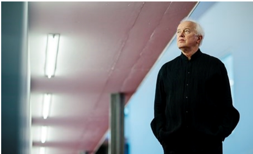
A rare European take on Elgar... Edo de Waart.

The Guardian, Thursday 5 December 2013 22.45 GMT